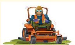
Last mowing by Nov 1* *pending no unexpected delays