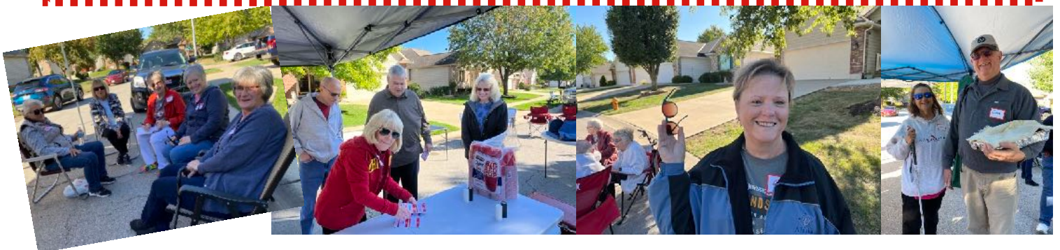
Photos from 2023-Picnic