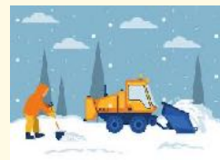
Snow Removal - Minimum 2 inches