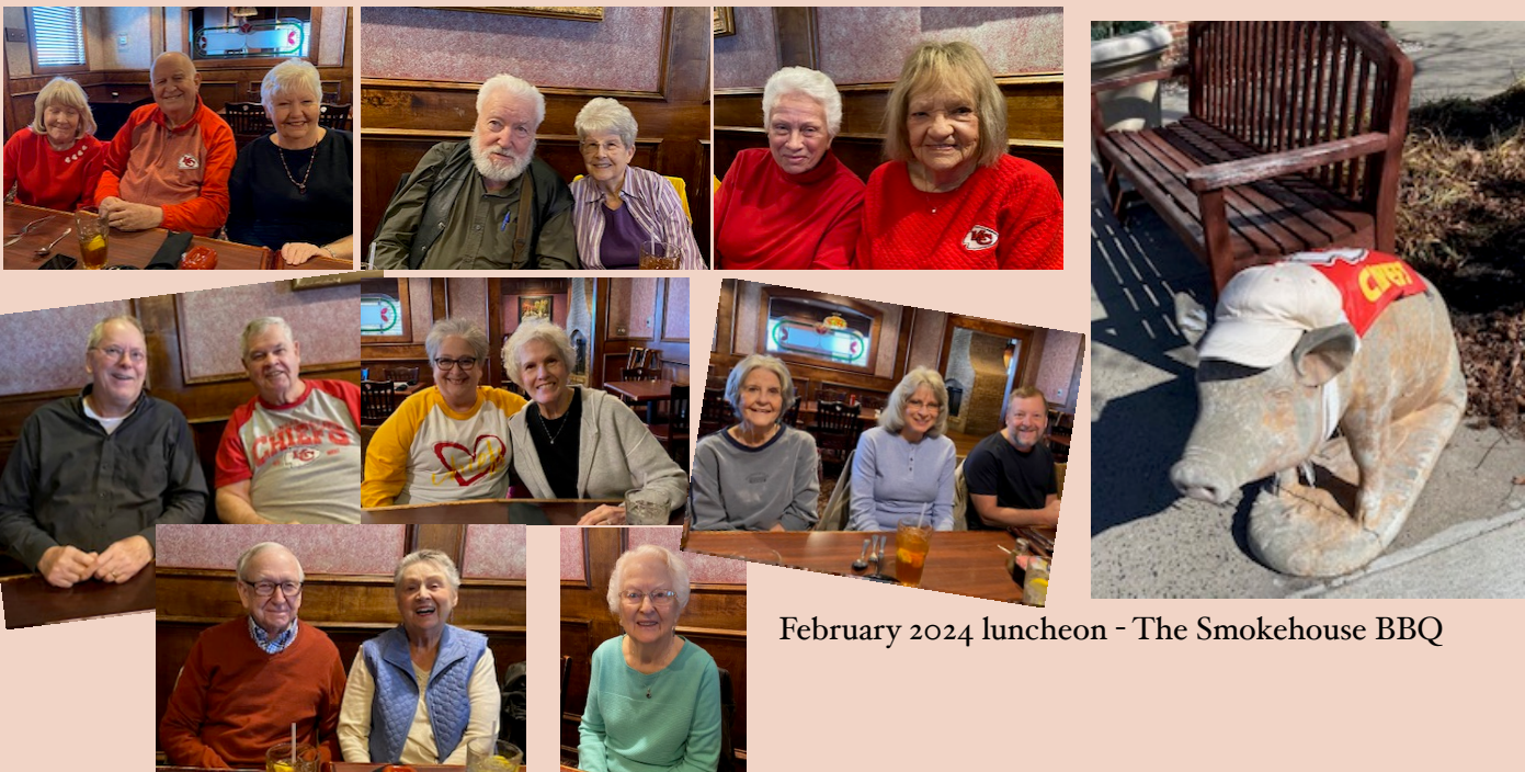
February 2024 luncheon - The Smokehouse BBQ

The Smokehouse BBQ Restaurant is another Favorite eatery for the Villas - and also loves the Kansas City Chiefs - SUPER BOWL CHAMPIONS! Villas peeps know good food! And they love to socialize with Villas friends and neighbors. On behalf of the Social Committee, thank all of you for your ongoing support and commitment to your community. Your presence at meetings and social activities is vital to the strength and safety of our neighborhood!